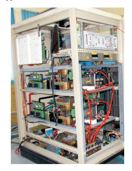
Fig. A.1.1: Photograph showing assembly details of a cabinet housing two power converters.

measurement data for five converters is consolidated in the form of a histogram as shown in Figure A.1.3. It is clear from the histogram that the stability of the power converter is well within \pm 50 ppm.