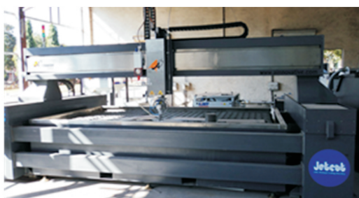
Fig. I.2.1: Front view of CWJCM.

Computer Numerical Control (CNC) Water Jet Cutting Machine (CWJCM) was installed and commissioned in Design and Manufacturing Technology Division of the Centre in December 2015 [Vol. 29 Issue 1, 2016, p35] Figure I.2.1 is the front view of the CWJCM. The main advantage of this water jet cutting machine is that it can be used for cutting/machining large size features in two dimensional (2D) profile on any metal/ non-metal, conducting/ non-conducting, hard/ soft material like ceramics, glass, stone or even leather and papers. It is based on the principle of non-conventional cutting where the material is removed by mechanical erosion, hence the cutting forces and the heat affected zone is negligible.