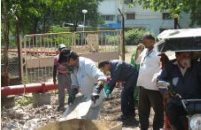
Pic 35 Around CTF