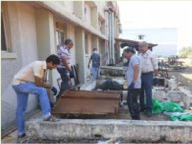
Pic 27 Around CSPCS building