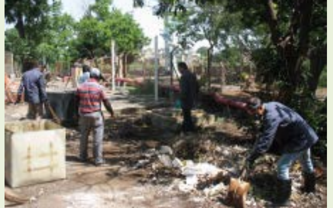
Pic 36 Around CTF