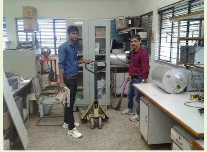
Pic 26 REML