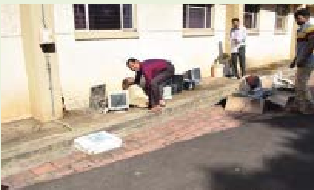
Pic 13 Around CSD building