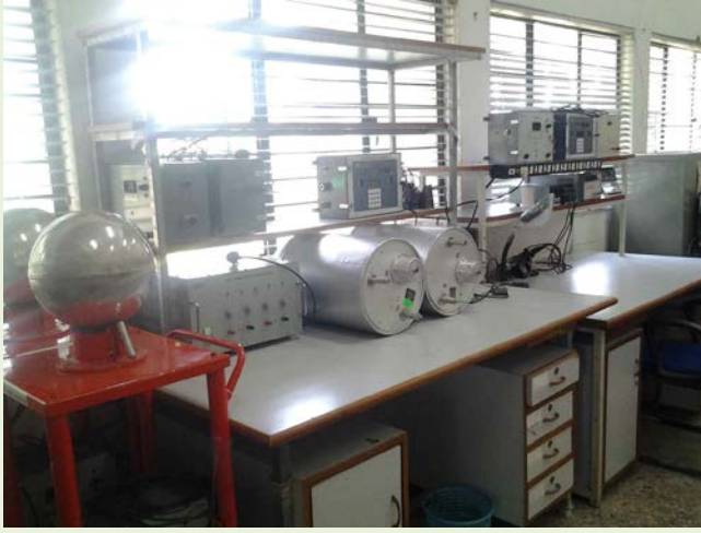
Pic 25 REML