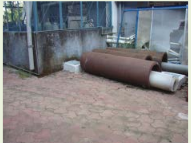
Pic 24 Around SCDD building (After cleaning)