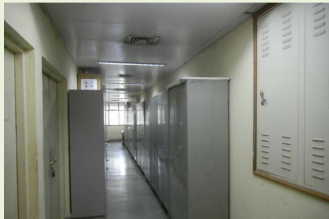
Pic 10 ACD, ADL building