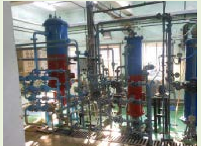
Pic 28 CSPCS building