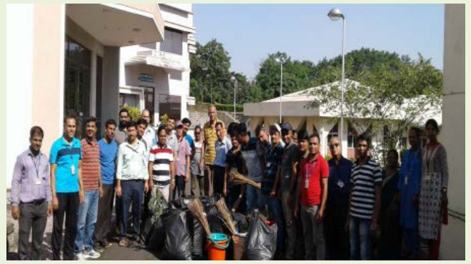
Pic 30 CD team