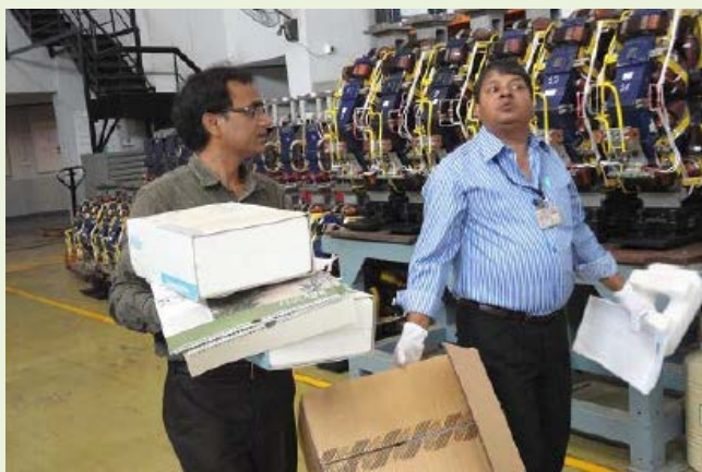
Pic 7 AMTD building