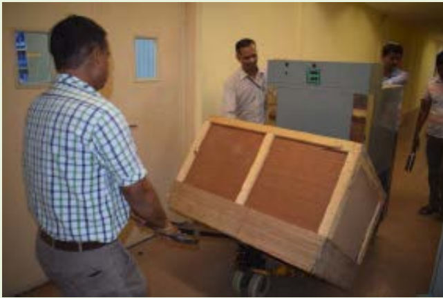
Pic 33 LPSD