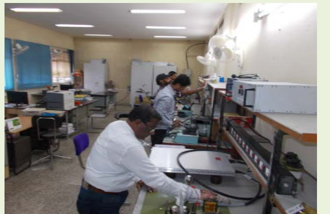
Pic 32 PCD