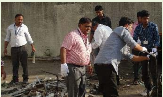
Pic 15 Around LCDFS building