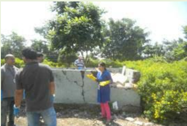
Pic 9 Around ADL building (ACD)