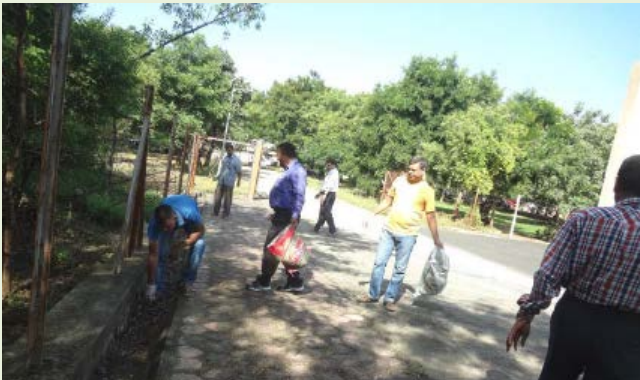
Pic 21 Around CSD building