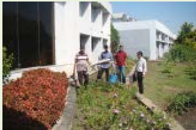
Pic 12 Around SUS building