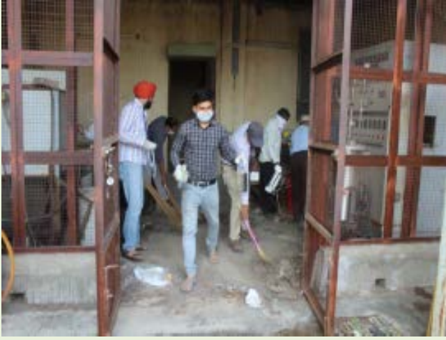
Pic 17 LFMD building