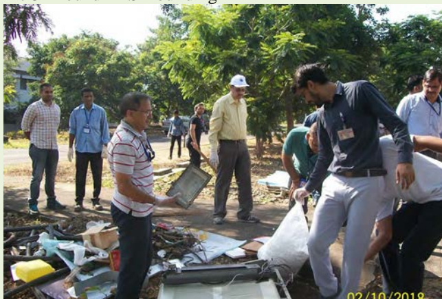
Pic 5 Around BDCSD & IOD building