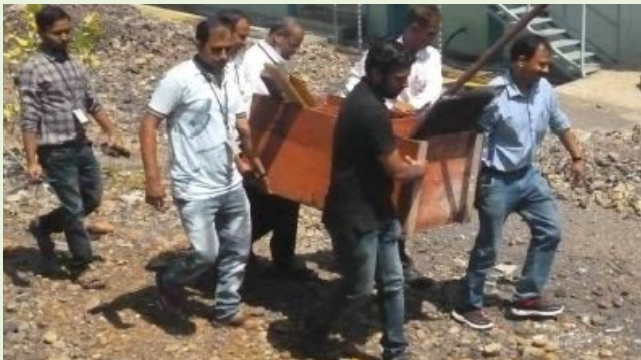
Pic 37 Around PLDD