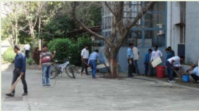
Pic 1 R&D Block 'A'