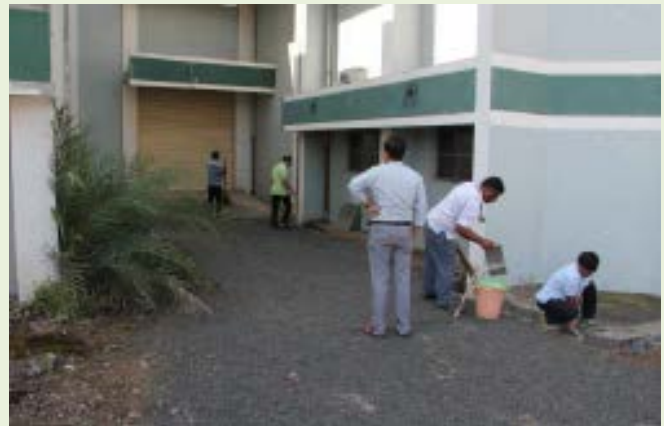
Pic 4 Around RFSD building