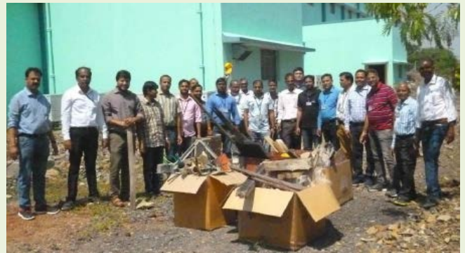
Pic 38 Around PLDD

Report prepared and compiled by Advisory Committee for Clean and Green Campus