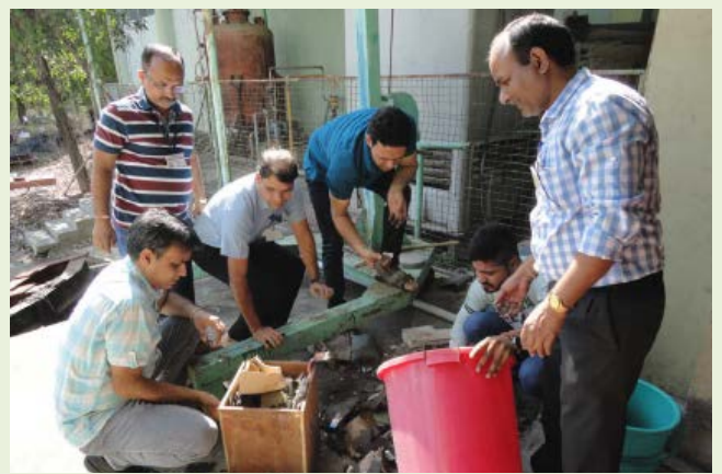
Pic 8 Around AMTD building