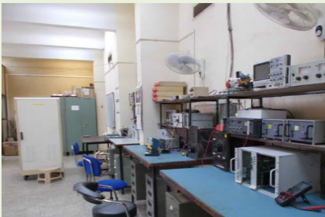
Pic 31 PCD