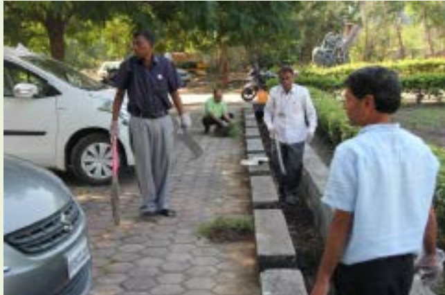
Pic 3 Around RFSD building