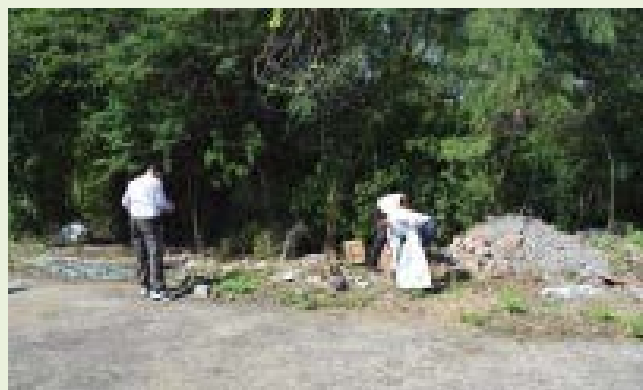
Pic 14 Around CSD building