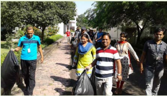
Pic 29 Around CD