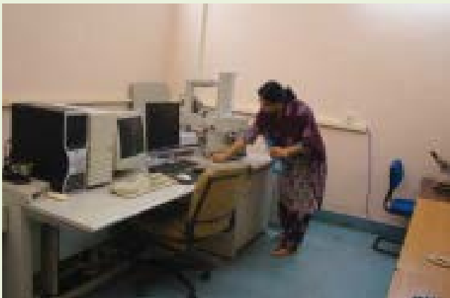
Pic 11 SUS building