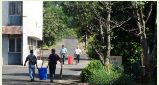
Pic 2 R&D Block 'A'