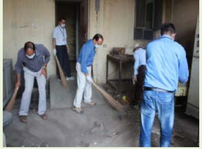
Pic 18 LFMD building