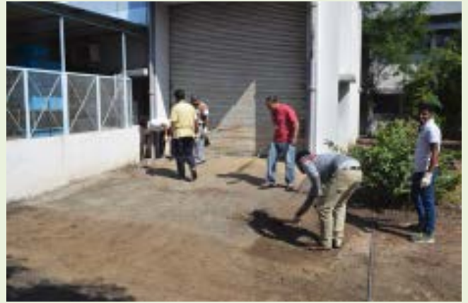
Pic 20 Around PPSD, ADL building