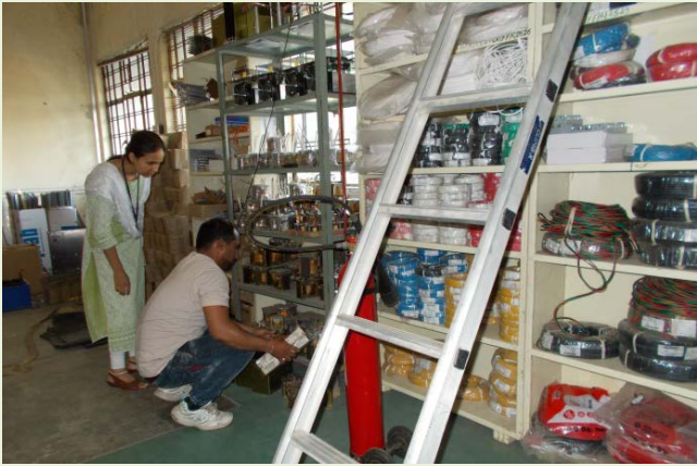
Pic 19 PPSD, ADL building