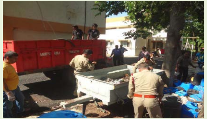
Pic 22 Around CSD building