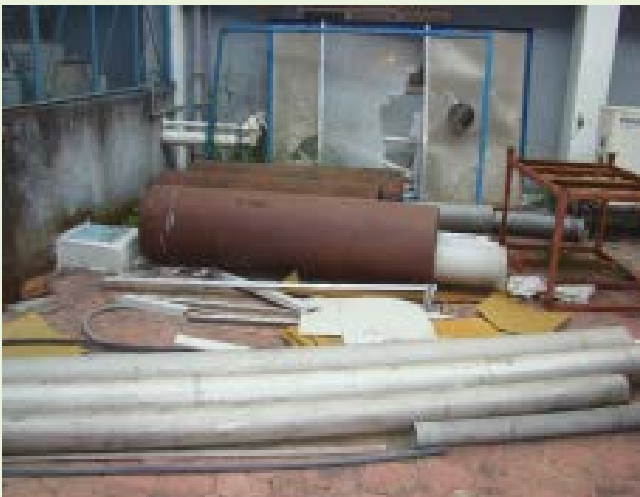
Pic 23 Around SCDD building (Before cleaning)