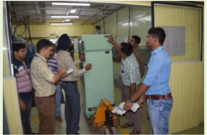
Pic 34 LPSD