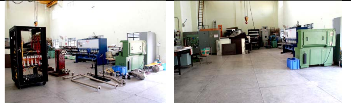
RF lab before and after cleaning