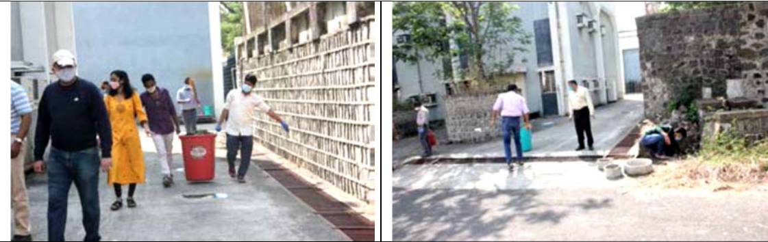
Cleaning activities in progress near LPD building