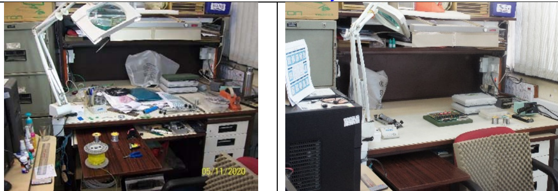
Room No.102 ADL