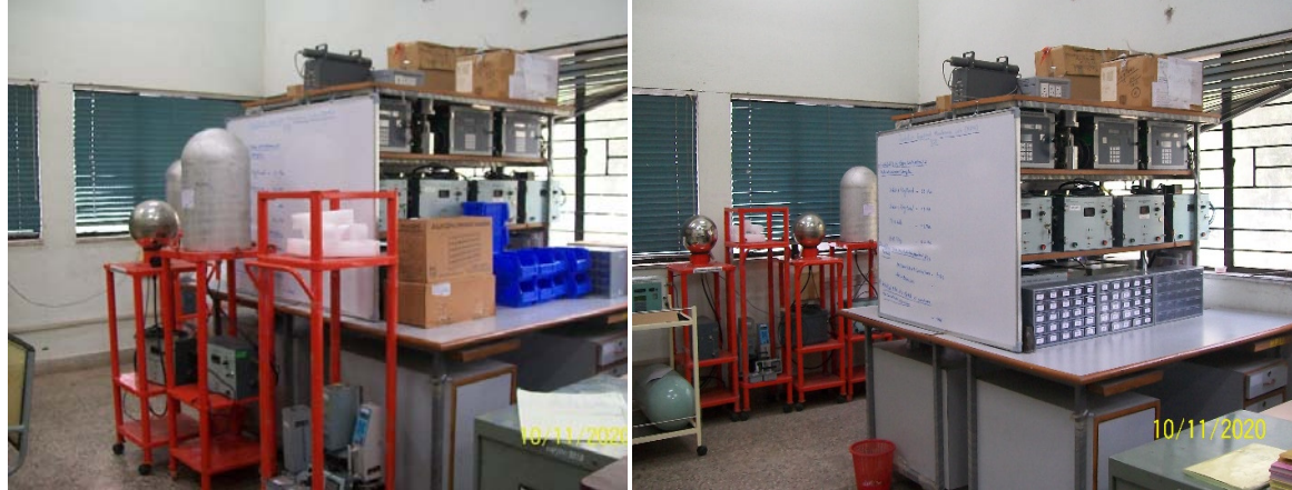
REML Laboratory before and after cleaning