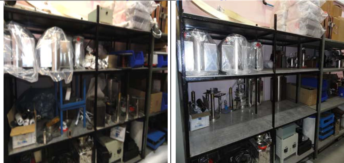
Components arranged in the storage rack (before and after cleaning)