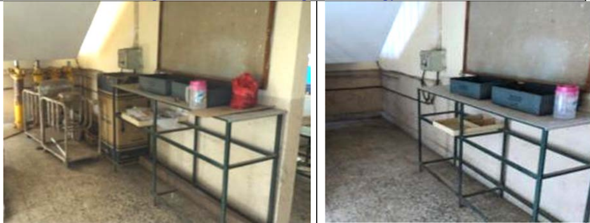
Entry of the Hill side work shop before and after cleaning