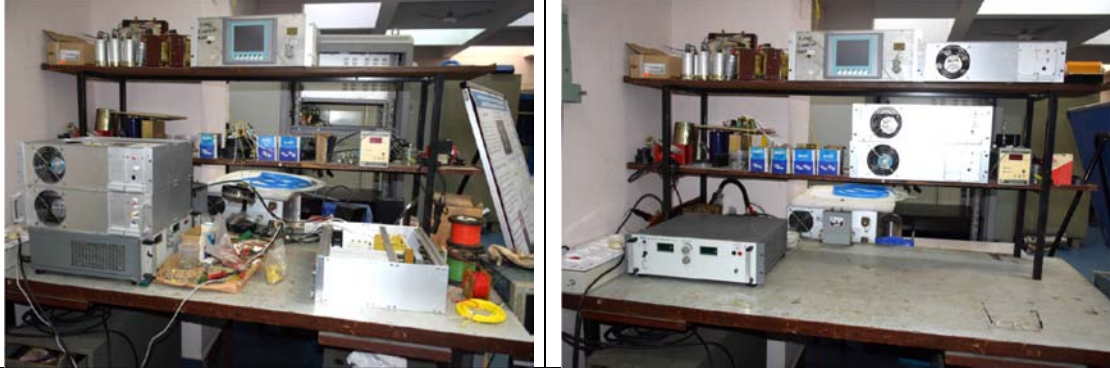
CVL Electronic Lab,G-9, C-1 Block, before and after cleaning