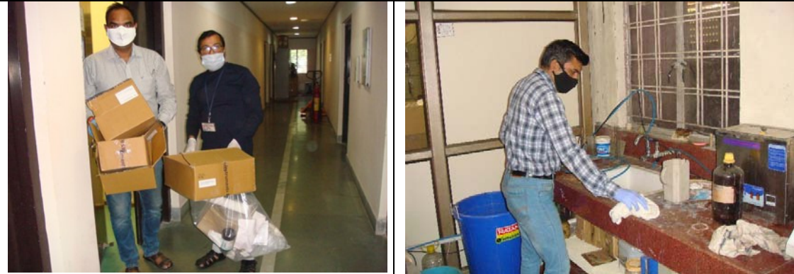
Cleaning in progress in different Labs of LMPD