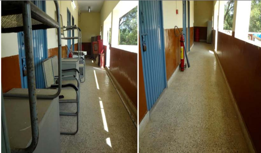
First floor corridor of the Fire Station before and after cleaning