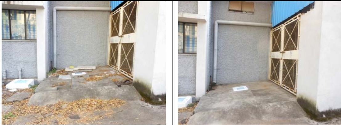
Front area of BDS building (Before and after cleaning)