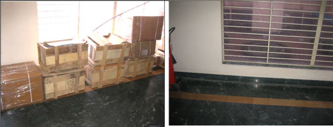
Lobby LED, G-Block before and after cleaning