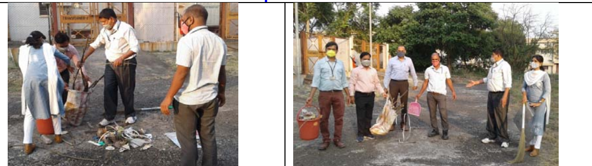
Cleaning activities in progress near IT bulidings