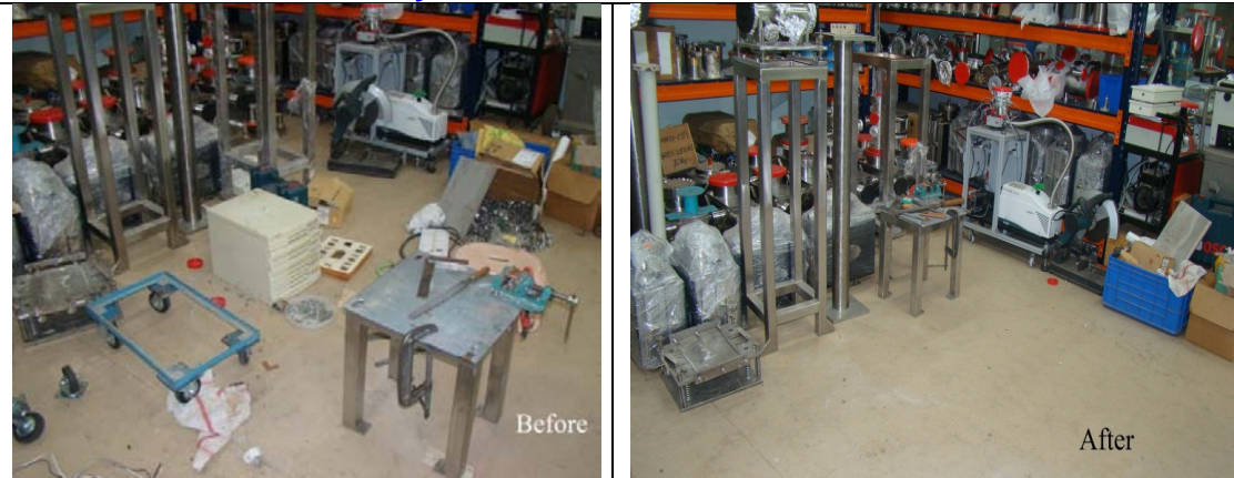
Indus experimental area before and after cleaning