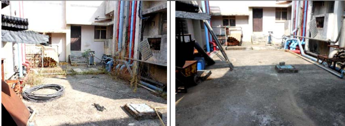
Indus-2 LCW plant secondary pipeline area before and after cleaning