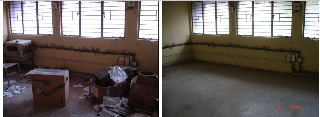
Lobby of Block-C1, LCID before and after cleaning