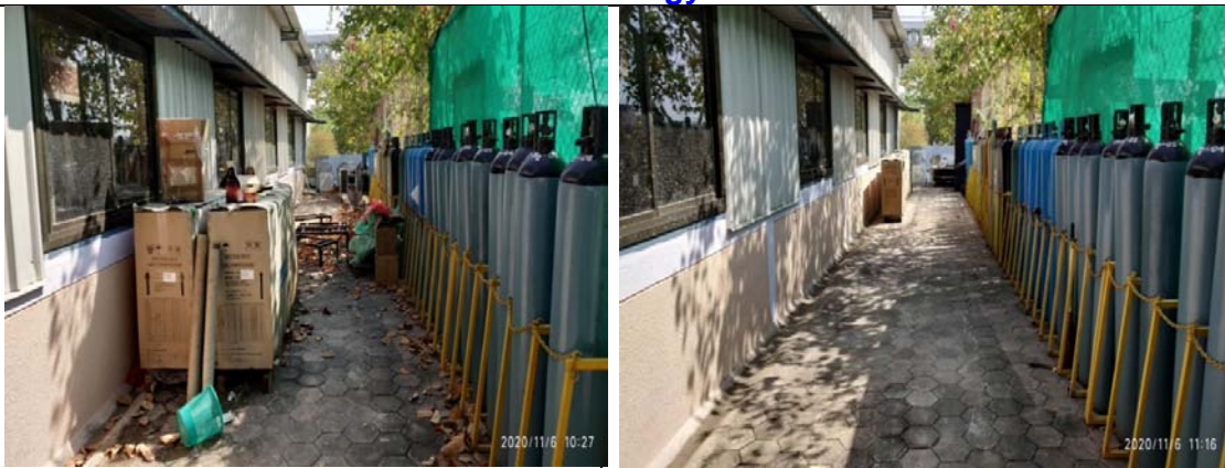
Gas cylinder storage lobby near LTD building before and after cleaning