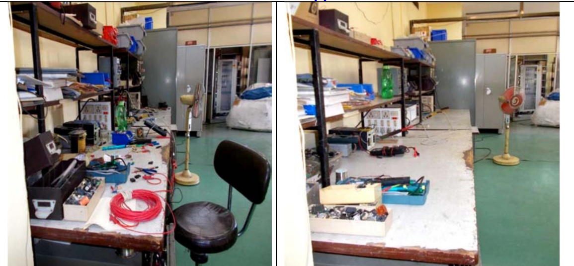
Laboratory area before and after cleaning