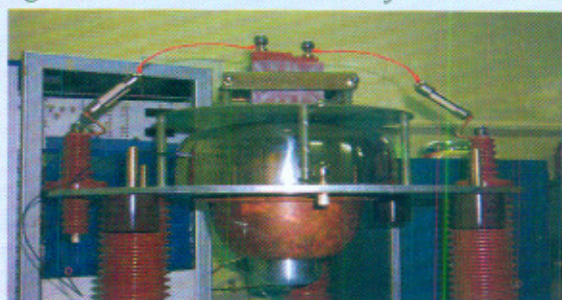
Fig. A.15.2 Filament power supply unit with high voltage dome removed

Fig.A.15.1 shows the complete schematic of the injector control unit. A high voltage dome fitted on the top of the stack provides an electrostatic shield to the filament supply unit as well as to the generator components. The output of the filament power supply is interfaced with the gun-filament through a high voltage common mode choke fitted with energy dissipating and surge arresting network consisting of glow discharge tubes and MOVs etc. The high voltage to the filament power supply is referred only at the gun end of this network with a solid copper strip of the shortest length. This helps in diverting the HV transients due to arcing in acceleration column directly to the DC column of the multiplier stack thus protecting the injector control unit. Fig.A. 15.2 shows the filament power supply housing.