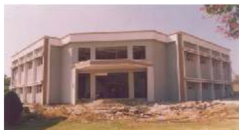
Information & Technology building

Construction of 18 nos. Type III-C & 6 nos. Type V-E houses, training school hostel building, extension of CAP building, HT cabling work for enhanced reliability of power system, OFC cabling – second phase, telephone cabling works are in progress. Tendering action has been initiated for several construction works like 18 nos. Type IV-D houses, construction of 48 nos. Efficiency Apartments, training school building, lab building for agriculture radiation processing facility, RF & Microwave Lab building, Laser Lab & Target lab, control room for water supply automation, power conditioning system lab, Alignment lab and extension of LCW plant etc.