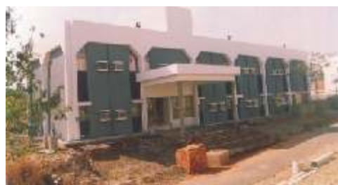
Extension of Laser Plasma Lab

Electrical works like installation, testing and commissioning of two substation one near Block 'C' and second one in colony, laying of OFC cable for colony exchange, 415 V, 160 A TPN Bus trunking system for equipment gallery of Indus-2 and HV cabling for Indus substation comprising of 6 runs of XLPE 11 kV cables from 132 kV substation to Indus substation were completed.