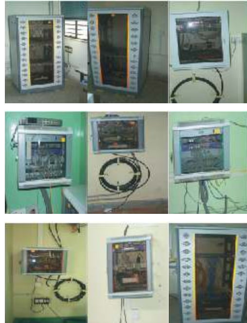
Fig 3 Phase-II networking rack installations of nine buildings

Phase-II of the OFC commissioning was completed in nine buildings, namely the Indus-I, MIA, B' Block, WS/B, LMD, LSL, HSL, Fabrication and Precision Lab.