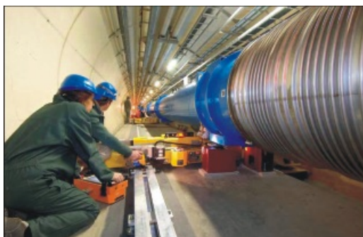
Fig. A.2.2 A picture of SSS in string-2 of LHC

(Contributed by: Abhay Kumar; abhay@cat.ernet.in)