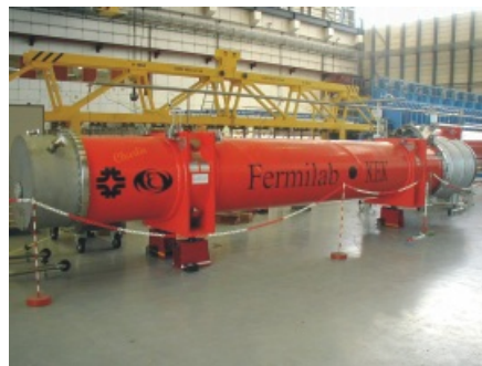
Fig. A.3.3 Inner triplet magnet Q3 on its jacks

(Contributed by: Jishnu Dwivedi; jishnu@cat.ernet.in)