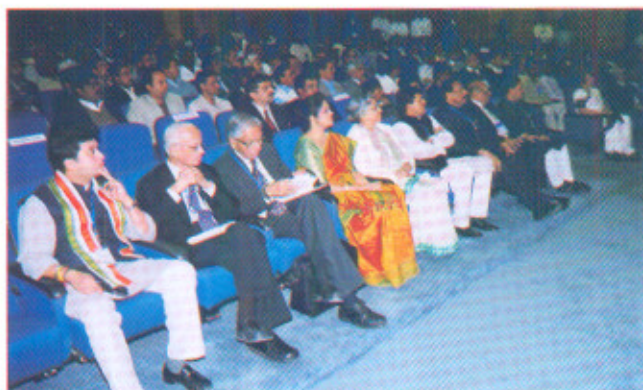
Guests, invitees & scientists of the Centre attending the renaming function