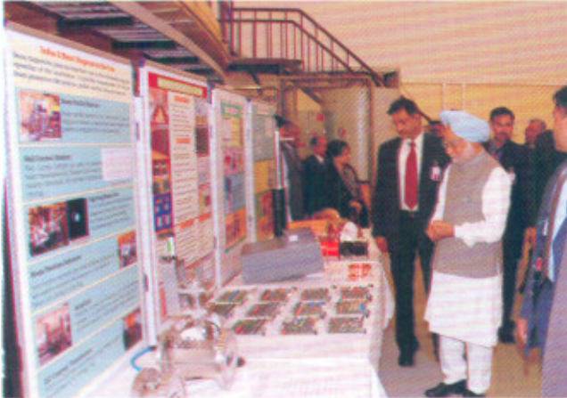
Dr. Manmohan Singh visiting the exhibition on the Centre's R&D activities