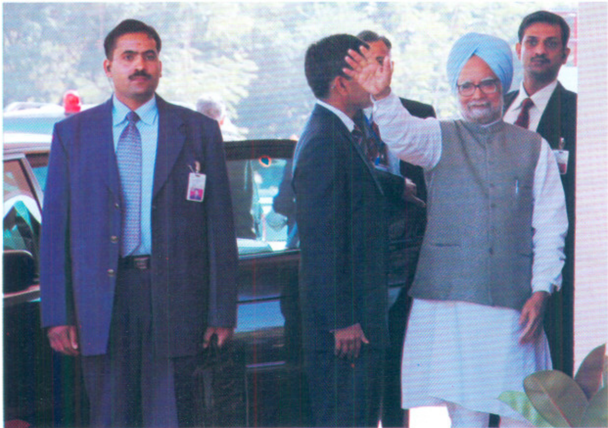
Prime Minister Dr. Manmohan Singh acknowledging the applause of the RRCAT family at the end of the function