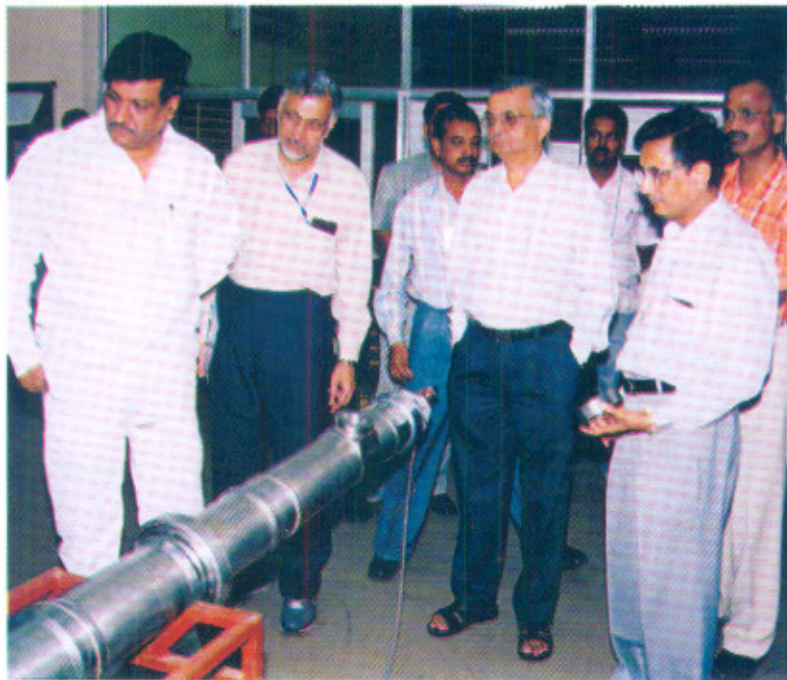
Hon'ble Shri Prithviraj Chavan seeing a demonstration on the use of laser based cutting and welding system developed for PHWR's en-mass coolant channel replacement