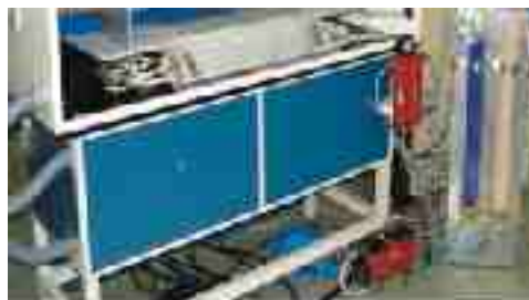
Fig. L.1.1 Disk amplifier module of Nd: glass high power laser chain.

pump pulse duration was measured to be 450sec. Fig. L.1.2 shows the gain obtained as a function of input pump energy. It is observed that the gain increases linearly with pump energy up to \sim 20\text{kJ} , and thereafter saturates to a value of \sim 6 at a pump energy of 36kJ. This is primarily due to the amplified stimulated emission, parasitic oscillations and also due to the change in the flashlamp spectra. At the pumping of 20kJ, the small signal gain is 5. This corresponds to a stored energy of 930J, which is about 5% conversion of the pump energy. The available gain at the operating intensity of 1\text{GW}/\text{cm}^2 is calculated to be 3.65. The spatial gain variation, along the minor axis of the disk aperture was also studied. The variation was found to be from 2.5 to 3.1 (min max). The disk amplifier was coupled to the laser chain and laser pulse output of 105J /1.5ns was obtained at operation at \sim 1\text{GW}/\text{cm}^2 .