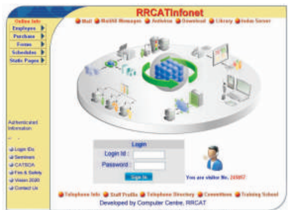
Fig. I.1.2: RRCAT Infonet portal.

One authenticated module for complete purchase information cycle has been developed and released on RRCATInfonet. The authorized users can view information related to all the purchase files including details of indent, enquiry, purchase order (PO), goods receipt, requisition voucher, PO concurrence, consolidated foreign and local payments and cheque. The online information is extracted from the Integrated Purchase-Stores-Audit information management software and Integrated Accounting software. Another authenticated module for XI Plan projects has been provided, which can be used by project coordinators to maintain the status of XI plan project reports.