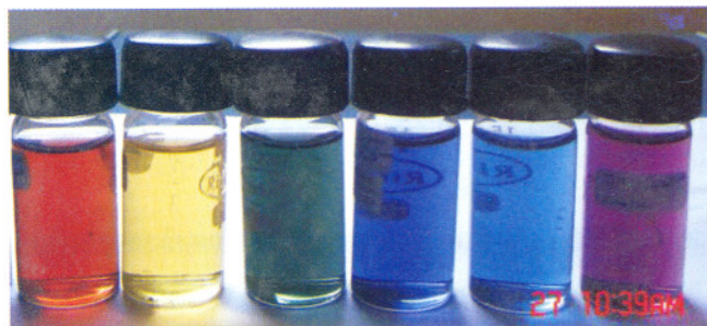
Fig.L.4.1: Silver nano-colloidal solutions of silver nanoplatelets of different aspect ratios. The nanoparticles in the yellow sample are spherical in shape while the particles in the magenta, orange, green, light blue and dark blue samples are nanoplatelets of increasing aspect ratio.

Metal nanoparticles can enhance the applied electric or optical field in and around the nanoparticle. This enhancement of optical field increases the nonlinear optical response of the nanoparticle by several orders of magnitude. It is also widely used for enhancing the signals in optical sensing applications like Surface Enhanced Raman Scattering, fluorescence detection etc. The enhancement of field occurs at wavelengths close to the surface plasmon resonance (SPR) of the nanoparticle. Thus it is necessary to tune the SPR peak of the nanoparticle for applications at different wavelengths. Spherical nanoparticles of a given metal have a single fixed SPR peak. Nanoparticles of anisotropic shapes can have multiple SPR peaks and the peak positions depend on the aspect ratio of the particle. Thus by controlling the aspect ratio of the nanoparticle it is possible to tune the SPR peak to the required wavelength.