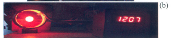
Fig. A.10.2: Photographs showing (a) The induction heating power supply and (b) A graphite block heated to 1200 °C.