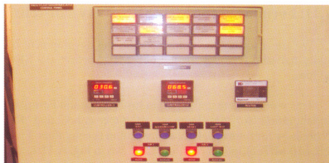
Fig. A.12. 2: A view of Control Panel in the UPS room, Indus-2.

Cooling section has water re-circulation arrangement and PVC water mist eliminator. In the Cell type Air washer units, humidification media is honeycomb structured fill pack blocks made of cellulose paper impregnated with chemicals and anti-soluble salts. The principle of evaporative cooling is relatively simple. Air moving past water will cause the water to evaporate. The heat necessary to cause evaporation is drawn out of the passing air stream and hence the air is cooled. With direct evaporative cooling, outside air is blown through a water-saturated medium (usually cellulose) and cooled by evaporation.