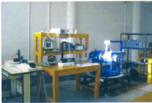
Fig. A.9.1: Spin wave measuring set up

Spin wave measuring set up has been developed at Tezpur University. The measuring setup is shown in Fig. A.9.1. It consists of pulsed power magnetron, TE102 cavity with ferrite spherical sample and a rotating electromagnet. RF power is applied parallel to the static magnetic field and at low power, negligible microwave power is absorbed by the ferrite samples. Beyond a certain critical or threshold value, there is an abrupt increase in the absorbed power level that gives rise to non-linear effects. The butterfly curve data is obtained by sweeping microwave power over a range of static magnetic field. An abrupt increase in absorption of microwave power marks the onset of nonlinearity. Instability is determined by the threshold microwave power level (advent of nonlinearity).