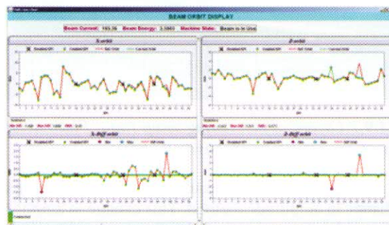
Fig.A.10.2: Beam orbit display client module

The beam orbit display client module is shown in Fig.A.10.2. This module displays present beam orbit, reference orbit and difference orbit for both the horizontal and vertical planes graphically along with all the calculated orbit parameters. This module polls the COD server component on the TCP /IP link periodically to get these orbit data. This is written in Java.