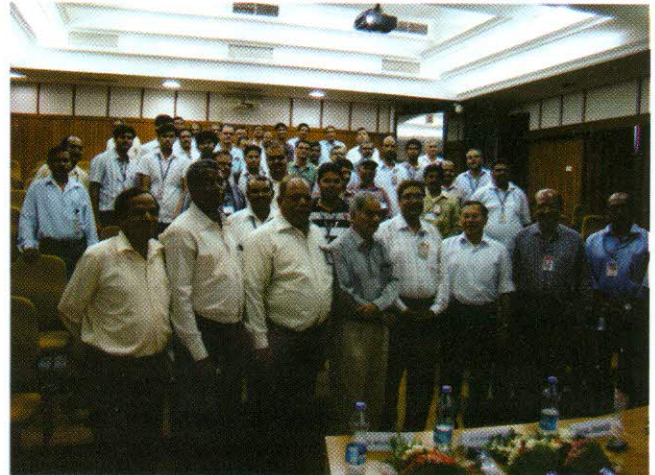
Chief guests, faculty members and participants during valedictory function

programme provided a platform to exchange ideas and share experiences on key issues relating to safety aspects in crane operation. Whole training programme was interactive. All participants took part very actively. On last day certificates were issued to the candidates.