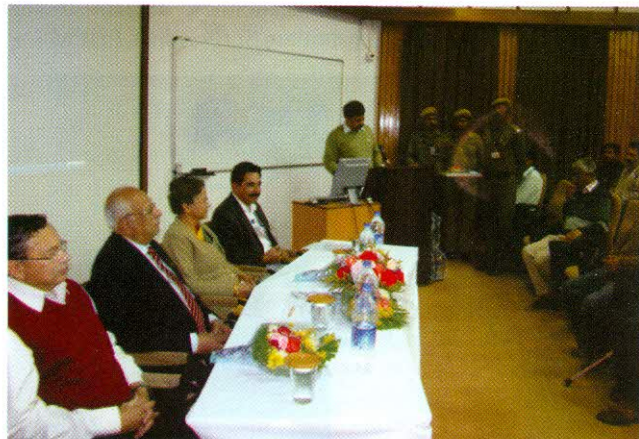
Inaugural Session in progress