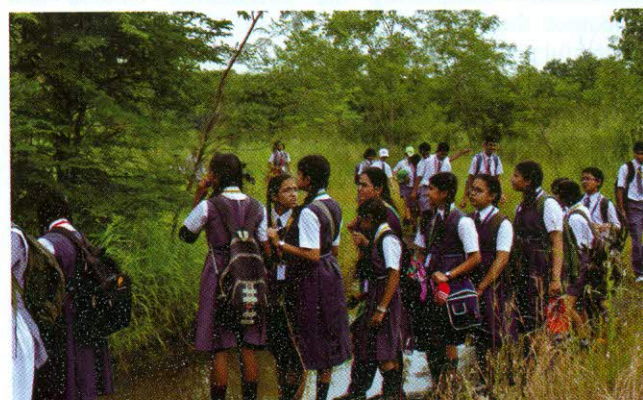
A group of AECS students near the upper lake plantation during Vansanchar 2