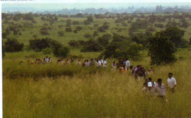
A group of participants along one of the trails in the unoccupied technical area during Vansanchar 1