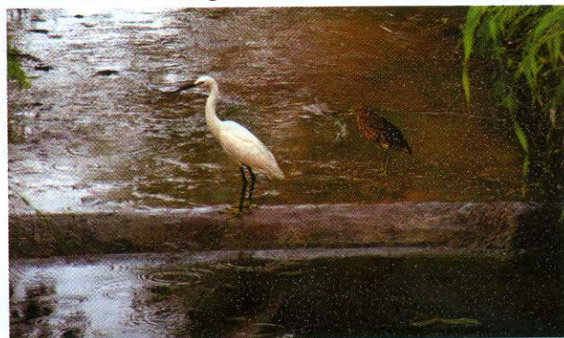
A white Egret (left) and a pond heron (right) photographed during the Vansanchar

Unmindful of the slush and overgrown grass on paths, participants explored the large scale plantations of mango (2200 trees), ber (800 trees), sitaphal (250 trees) and jatropha (10,000 trees) and terrain appropriate forestry plantation including tree species like neem, aritha, amla, beheda, khejri, sandalwood etc. It was a good opportunity to appreciate the biodiversity of the campus of the RRCAT and explore the continued efforts being made to increase the green cover.