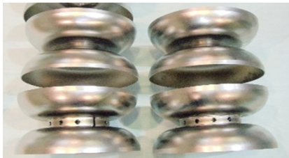
Fig. A.5.1: Dumbbells fabrication progress

Owing to very high Q, SCRF cavities are extremely sensitive to geometrical changes and due care is required at every stage of fabrication to control them. Based on the experience gained during earlier work on 1.3 GHz multi-cell SCRF cavity development, a detail manufacturing process sequence plan was made for 650 MHz five-cell SCRF cavity. Detail production and QA plan was made to monitor the frequency and dimensional variation during various stages of manufacturing. Various machining and welding fixtures were also designed and fabricated. The forming of 4 mm thick high RRR Niobium sheets was done in-house using a 120 ton press. Pull-out die and punch was designed and developed in-house and pull-out in main coupler beam tube is successfully carried out. Cavity components were machined and fitment were made within 50 \mu\text{m} tolerance. Stage inspection of all the cavity components and sub-assemblies were carried out to monitor and control dimensional parameters.