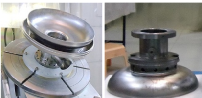
Fig. A.5.2: End-Groups fabrication progress

The cavity is welded using in-house 15 kW EBW machine facility. All the parts were subjected to 20 \mu\text{m} Buffered Chemical Polishing (BCP) before welding. Half-cells are back to back welded at iris to form dumbbells. Further stiffening rings are welded on dumbbells to impart mechanical rigidity required to mitigate detuning due to Lorenz force and Microphonics. The length and cavity RF frequency were targeted for 300 K values. RF measurements