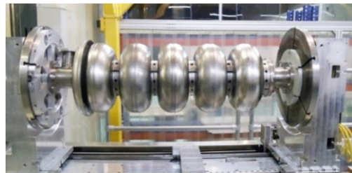
Fig. A.5.3: First 650 MHz ( \beta=0.92 ) five-cell SCRF cavity welding in progress

were carried out at half-cell and dumbbells stages to estimate the trimming length to achieve the desired frequency. Special tuning fixture was designed and developed to tune the dumbbell to achieve the target frequency and length. Parts of both the end-groups were machined and EB welded. End groups were also tuned for RF frequency. Figures A.5.1 and A.5.2 show the progress on dumbbell and End-Group respectively. RF analysis of each dumbbell and both End-Groups was done to finalise the proper sequence for optimum RF frequency. Subsequently, the five crucial equator weld were performed with full penetration as shown in Fig. A.5.3.