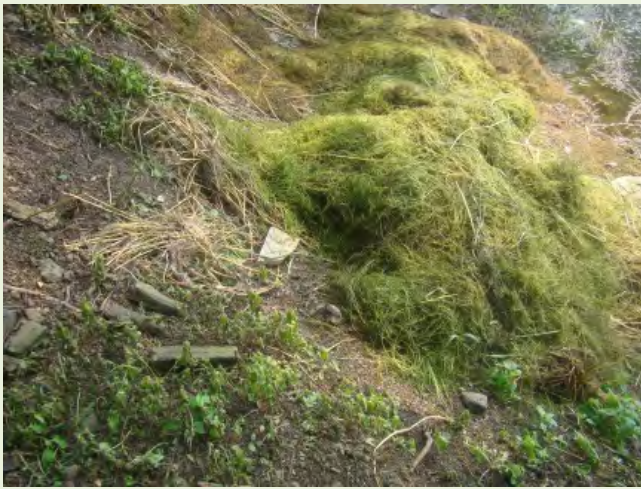
Pic 17 Weeds removed from the lake and ready for further disposal (20-09-2017)