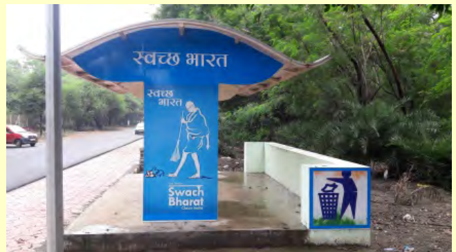
Pic 15 A poster on Swachh Bharat Mission (27-09-2017)