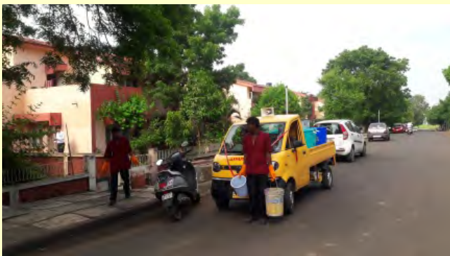
Pic 14 Door-to-door collection of domestic waste using segregated bins (27-09-2017)

Exhibition of improved method of collection: