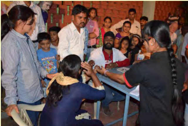
Pic 2 Street-play: Scene2 (25-09-2017)