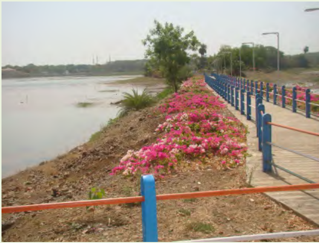
Pic 16 Weeds seen in the lake (14-09-2017)