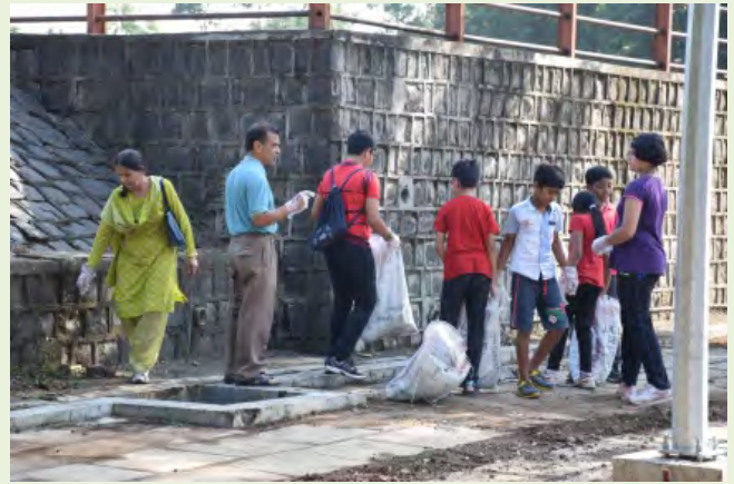
Pic 11 Team near AECS playground (24-09-2017)