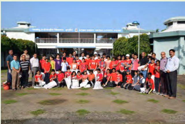
Pic 10 AECS students with their teachers (24-09-2017)