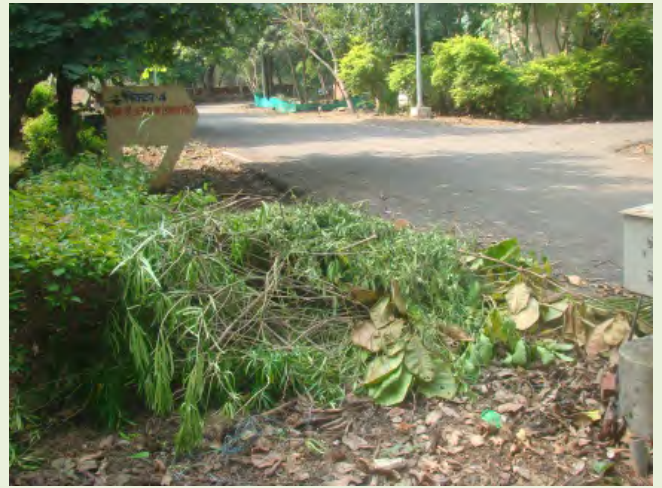
Pic 18 Sector-4: Garden waste collected (20-09-2017)