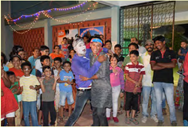
Pic 1 Street-play: Scene1 (25-09-2017)