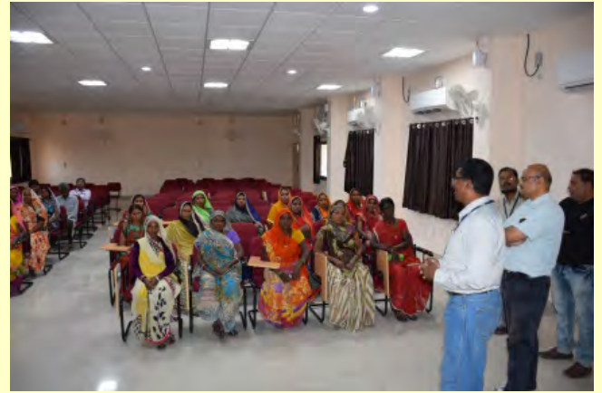
Pic 5 Short films on Swachhta shown to cosmetic and guest house kitchen workers (28-09-2017)