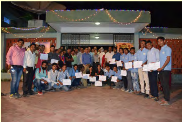
Pic 3 Street-play: Certificate distribution (25-09-2017)