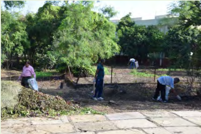
Pic 9 Area around palace gate being cleaned (24-09-2017)