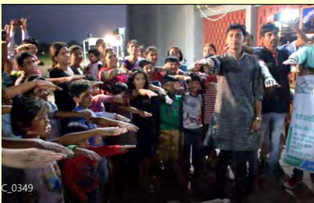
Pic 4 Pledge on Swachhta (25-09-2017)