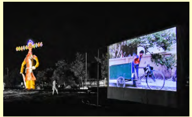
Pic 7 Awareness campaign: Films on cleanliness shown to the gathering on Dussehra day (30-09-2017)