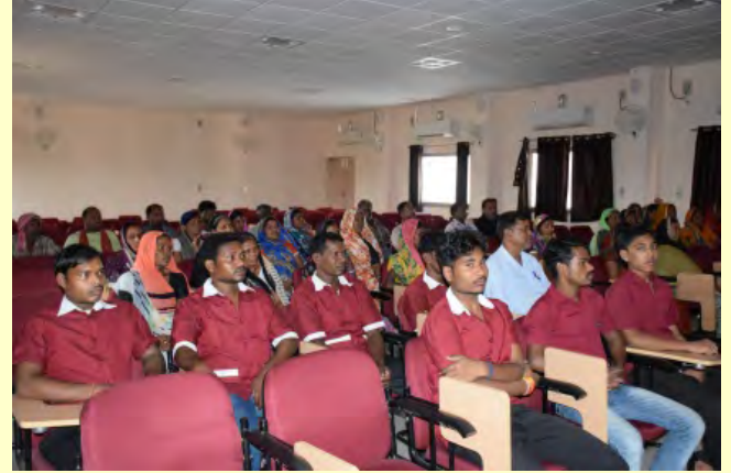
Pic 6 Audience carefully watching short films on Swachhta at SFC, Guest House (28-09-2017)