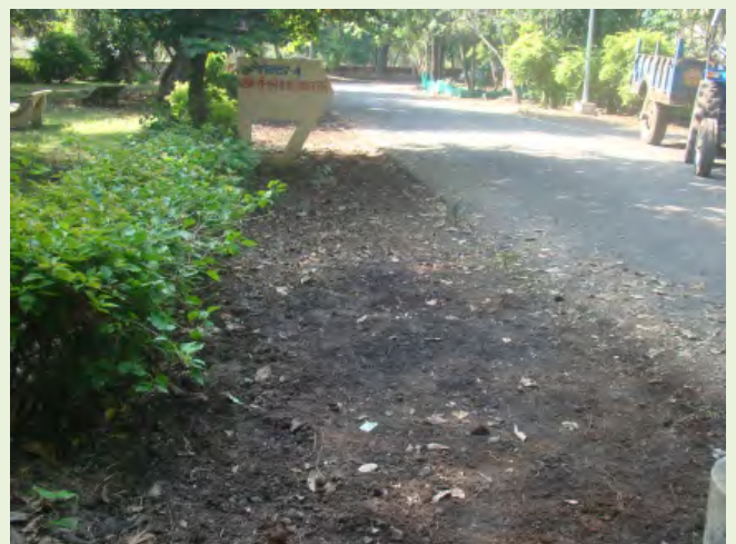
Pic 19 Sector-4: Garden waste removed (26-09-2017)