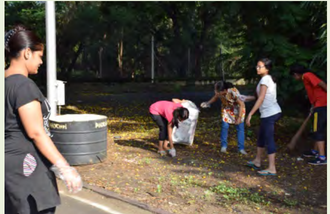
Pic 12 HBNI scholars and trainees seen around the guest house (24-09-2017)