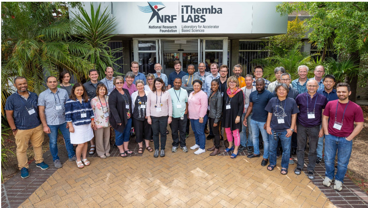
Figure 2: Example of a full-width figure showing the JACoW Team at their annual meeting in December 2018. This figure has a multi-line caption that has to be justified rather than centred.

The names of authors, their organizations/affiliations and postal addresses should be grouped by affiliation and listed in 12 pt upper- and lowercase letters. The name of the submitting or primary author should be first, followed by the coauthors, alphabetically by affiliation. Where authors have multiple affiliations, the secondary affiliation may be indicated with a superscript, as shown in the author listing of this paper. See ANNEX A for further examples.